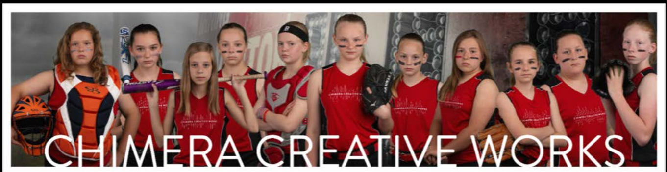
2' x 8' Banner